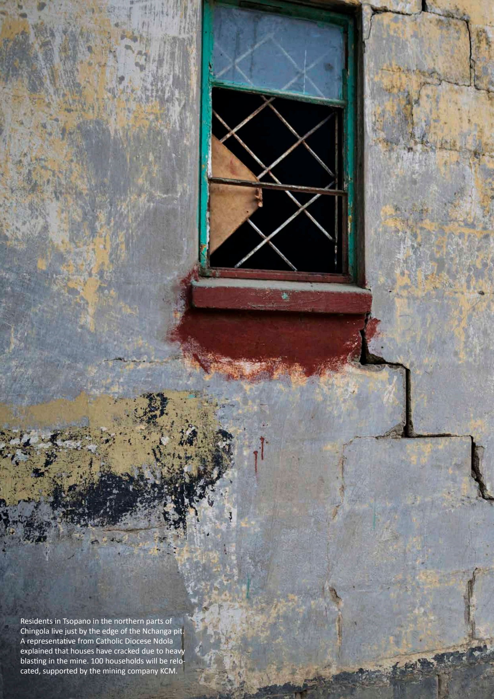
Residents in Tsopano in the northern parts of Chingola live just by the edge of the Nchanga pit. A representative from Catholic Diocese Ndola explained that houses have cracked due to heavy blasting in the mine. 100 households will be relocated, supported by the mining company KCM.