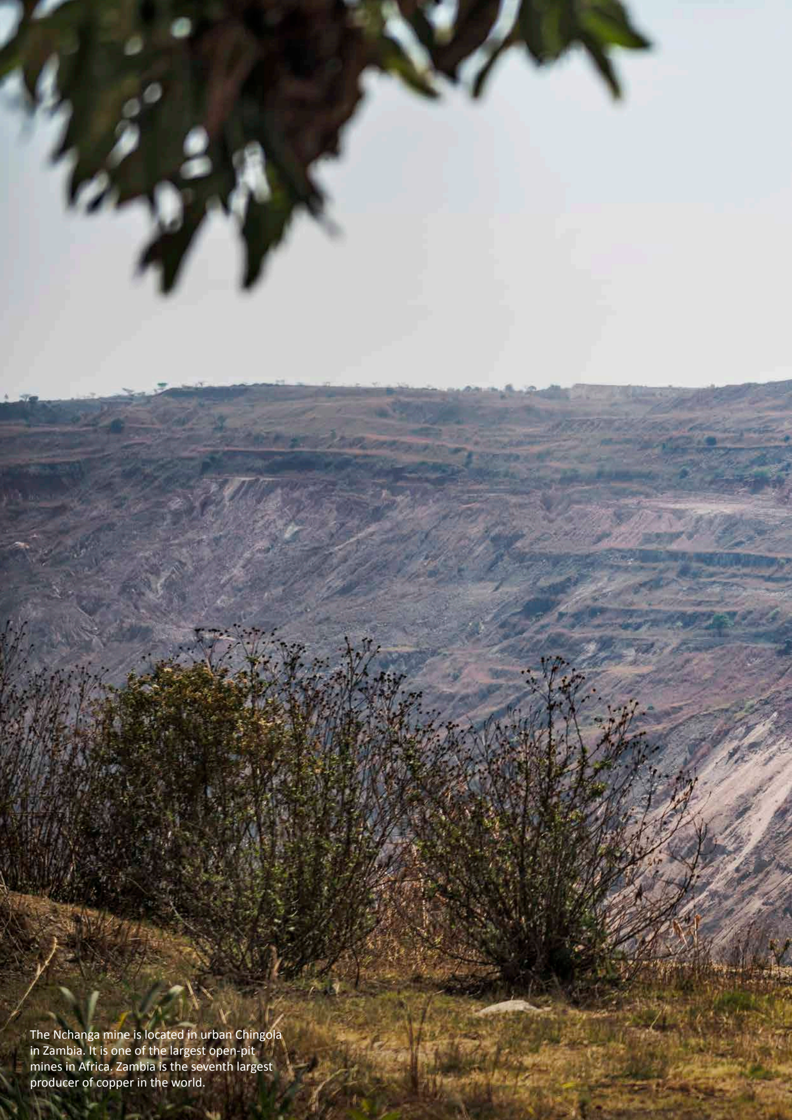
The Nchanga mine is located in urban Chingola in Zambia. It is one of the largest open-pit mines in Africa. Zambia is the seventh largest producer of copper in the world.