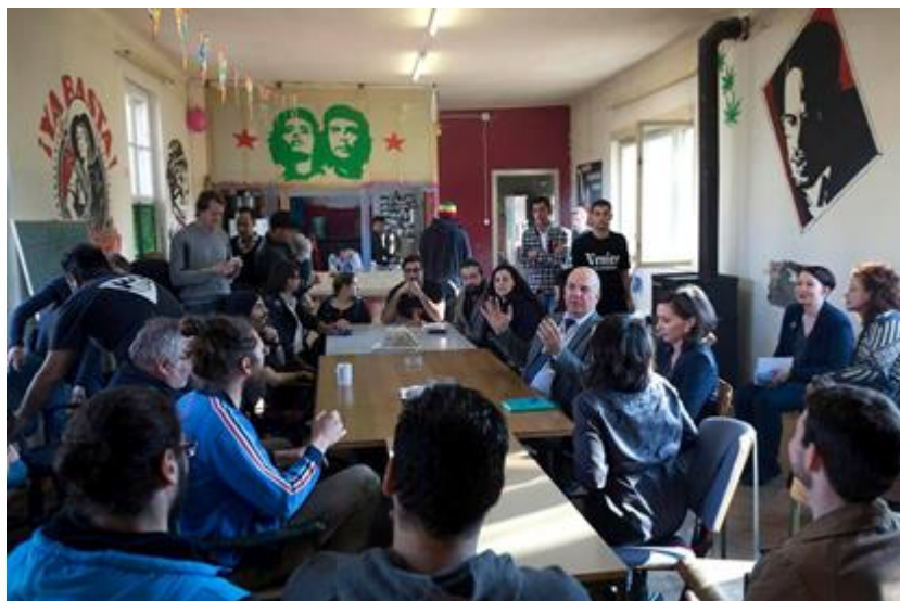
Photo: Second Home collective hosting Nils Muižnieks, Council of Europe's Commissioner for Human Rights in March 2017

Type of the engagement of the organisation: local